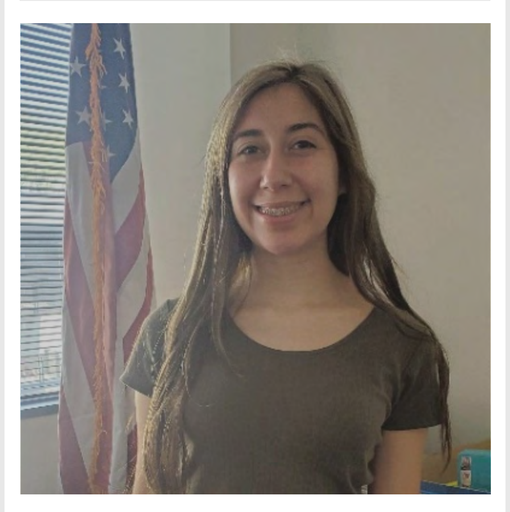
JOURNEY FROM HOMELESSNESS TO HELPING THE UNHOUSED

EWDD administers the jobs and education program for the City's Gang Injunction Curfew Settlement, also known as the Los Angeles Reconnections