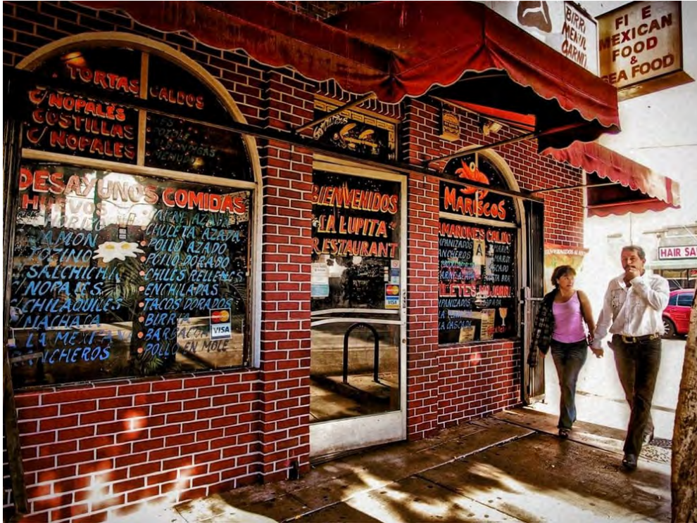
Family-owned La Lupita Restaurant (above) received a grant from the LA Regional COVID-19 Fund that is helping it stay afloat during COVID-19.