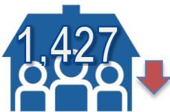
Enrollments (Down 13%)