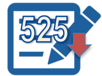
Registrations (Down 12%)