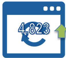
New Sessions (Up 0.4%)