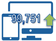
Page Views (Up 2.3%)