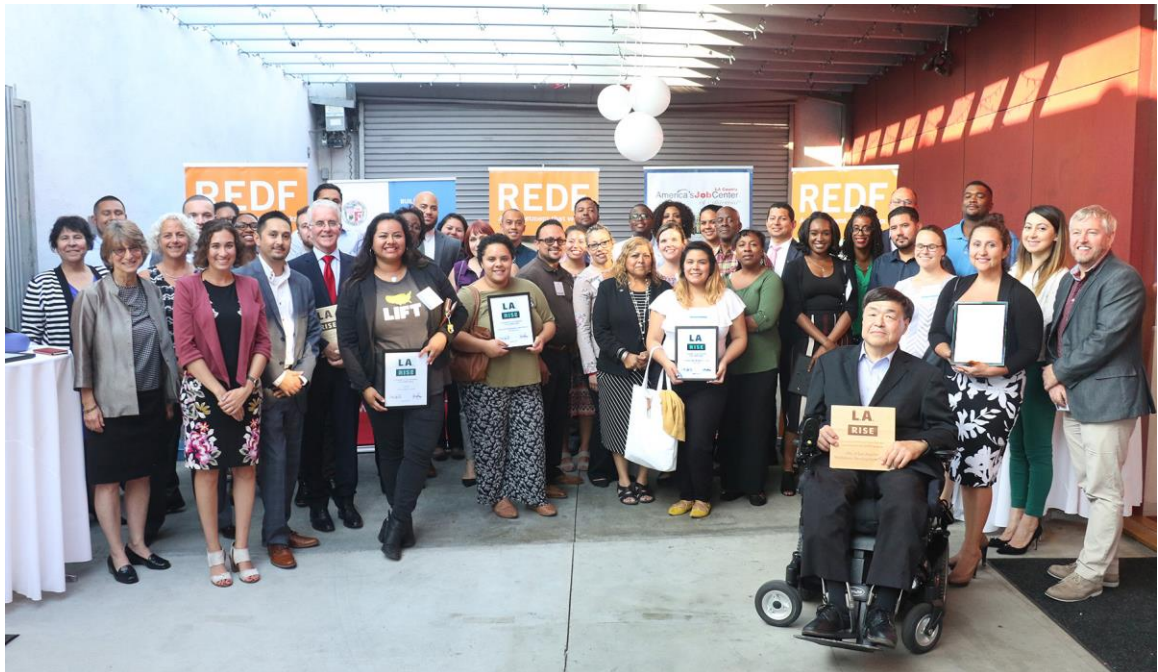
Representatives from more than 40 partners gathered last week to celebrate LA:RISE achievements and the expansion of the program to LA County

More than 1,000 people have found work through the Los Angeles Regional Initiative for Social Enterprise (LA:RISE), a five-year program designed to serve the populations hardest to place in jobs, including