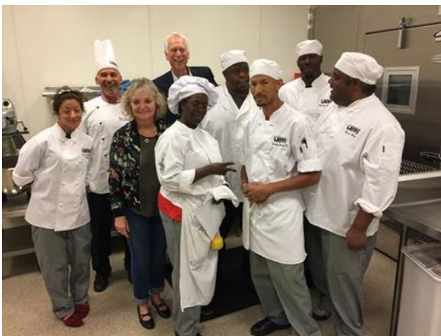
Veterans and their family members are taking culinary training at Bob Hope Patriotic Hall

The Vernon Central WSC recently created a partnership between Bob Hope Patriotic Hall and LATTC to train veterans in the culinary arts and professional baking. Culinary Arts staff at LAATTC is training students in securing their ServSafe Certificate-Manager level while simultaneously teaching them the fine arts of food preparation and cooking. Training began in mid-July and is scheduled to be complete on October 6. The current cohort is eight students, including five veterans and three family members of the veterans. Several of the veterans experienced long-term unemployment and other barriers and the program provides an opportunity for them to transition into a fulfilling civilian opportunity.