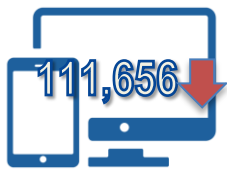
Page Views (Down 0.1%)