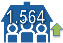
Enrollments (Up 6%)