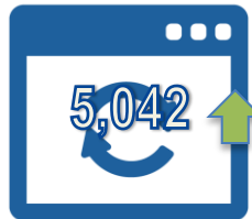
New Sessions (Up 5.9%)