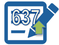
Registrations (Up 4%)