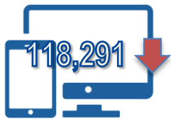
Page Views (Down 15.1%)