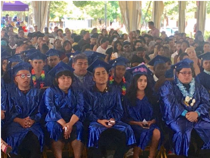
South LA YouthBuild Program graduates were celebrated at a ceremony June 22, 2017 at LA Trade Tech College.

More than 90 students graduated from the South Los Angeles YouthBuild (SLAYB) Program at Los Angeles Trade Tech College (LATTC) on June 22, 2017. Operated by the Coalition for Responsible Community Development (CRCD) and funded in part by EWDD as part of its YouthSource and WorkSource system, SLAYB is a comprehensive program aimed at improving the education and long-term employment prospects of youth in South Los Angeles. The program prepares participants for success in the construction labor market by providing individualized occupational training and case management linked to workforce development and educational services, as well as opportunities for service learning, mentoring,