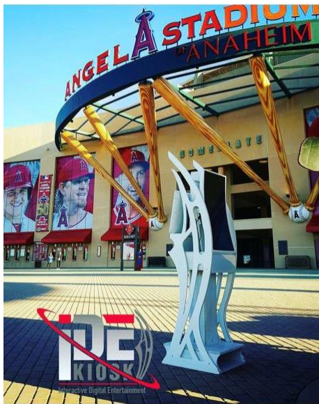
PHOTO BOOTH AND CATERING: NORTH VALLEY BUSINESSSOURCE CENTER HELPS ENTREPRENEUR LAUNCH SUCCESSFUL BUSINESSES