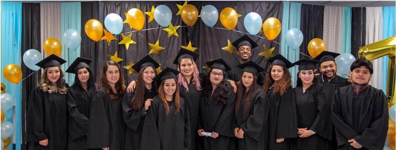
Class of 2017 – Para Los Niños held a graduation ceremony for its Certified Nursing Assistant students. For many, this was their first experience with pomp and circumstance.

Donning cap and gowns for the first time, 17 students walked across the stage on April 7 to celebrate their graduation from the Certified Nursing Assistant (CNA) program at the Para Los Niños (PLN) YouthSource Center. PLN staff organized the event for students to give them the opportunity to experience the pomp and circumstance of a graduation ceremony with the support of family and friends in the audience. Students completed a customized 11 week intensive training that included classroom instruction and clinical skills training