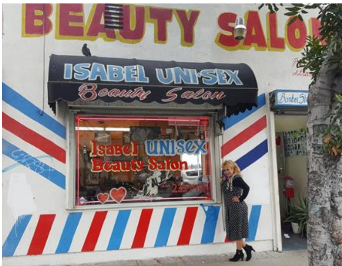
Isabel Beauty Salon is located at 4060 S. Central Ave. in South LA

Over the past 26 years, Isabel Beauty Salon in South Los Angeles has become a favorite local hangout, with lines of people waiting to get in for the latest hair style.