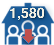
Enrollments (Down 1%)