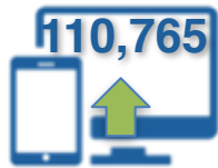
Page Views (Up 40%)