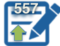
Registrations (Up 1%)