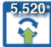
New Sessions (Up 46%)