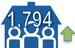
Enrollments (Up 56%)