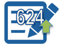
Registrations (Up 58%)