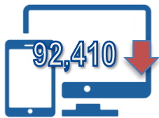
Page Views (Down 1.7%)