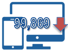
Page Views (Down 1.4%)