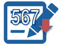
Registrations (Down 5%)