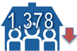
Enrollments (Down 35%)