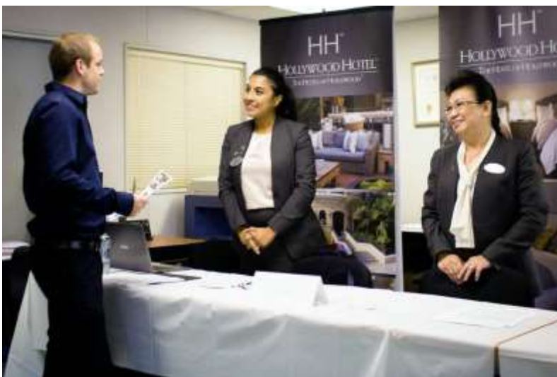
A job seeker interviews with Hollywood Hotel representatives at the Hospitality Job Fair hosted by the Hollywood WorkSource Center

Fifteen people were recently hired to work at several Los Angeles area luxury hotels after a successful hospitality job fair held by the Hollywood WorkSource Center on Friday, October 20, 2017. EWDD partner Managed Career Solutions (MCS), held the targeted recruitment event after identifying an employer need in anticipation of several hotels opening in the next few months in West Hollywood. After being prescreened and receiving interview preparation from MCS, approximately 60 job seekers met with and provided resumes to representatives from Kimpton La Peer, W Hollywood, Palisociety, Beverly Hills Hotel, Hotel Bel Air, Jeremy West Hollywood and The Hollywood Hotel. Shortly after the job fair, approximately 30 participants were interviewed